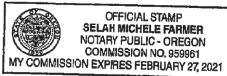
Notary Public-State of Oregon